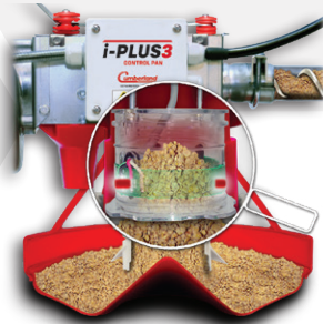
When the feed level breaks all three of the infrared sensors, the auger will stop automatically.