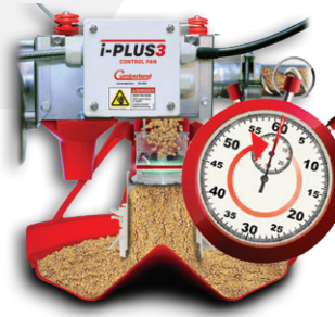
When the feed drops below the infrared sensors, the auger will re-start automatically after a 60 second delay.