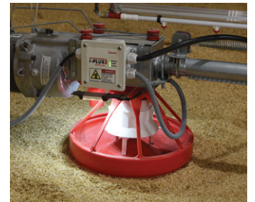
POWER SUPPLY IS INCLUDED IN THE i-PLUS3 CONTROL PAN FOR AN OPTIONAL LED LIGHT.